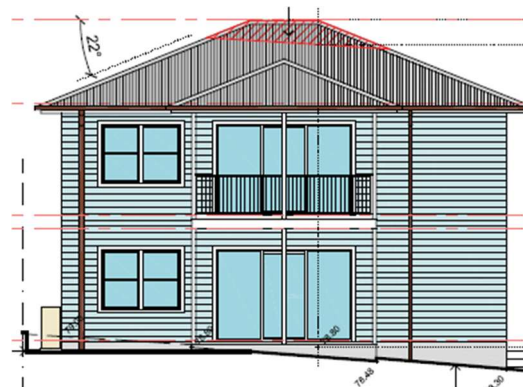
9 Broughton Street Carpark elevation

(Source: distinctive Living Design 2/4/25 Amended Architectural Plans )