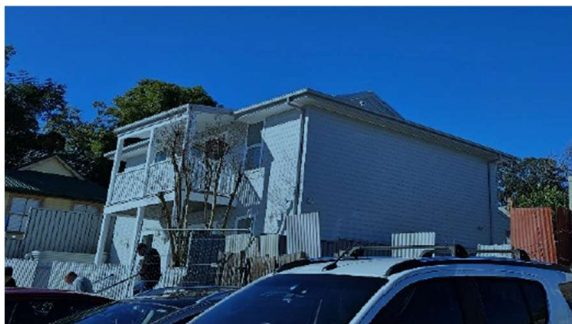
7 Broughton Street Recent photo from carpark

(Source: distinctive Living Design 2/4/25 Amended Architectural Plans )