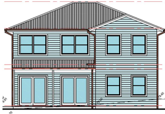
9 Broughton Street