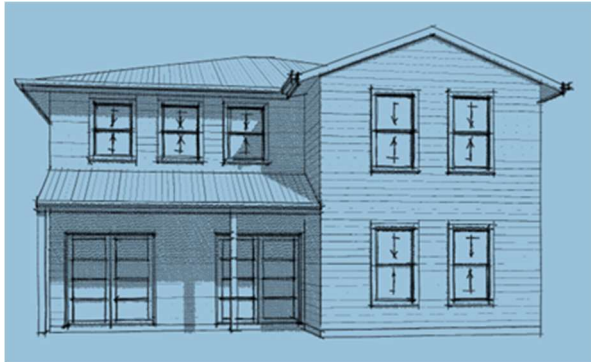
7 Broughton Street

Both the existing rear building at No 7 and the proposed new build at No 9 create a visual impact from the carpark. As shown immediately below, together, we believe the existing and proposed buildings should present reasonably cohesively and add interest. In particular the inclusion of access to No 9 from the carpark via a path of recycled bricks and plantings should activate and soften the parking area.