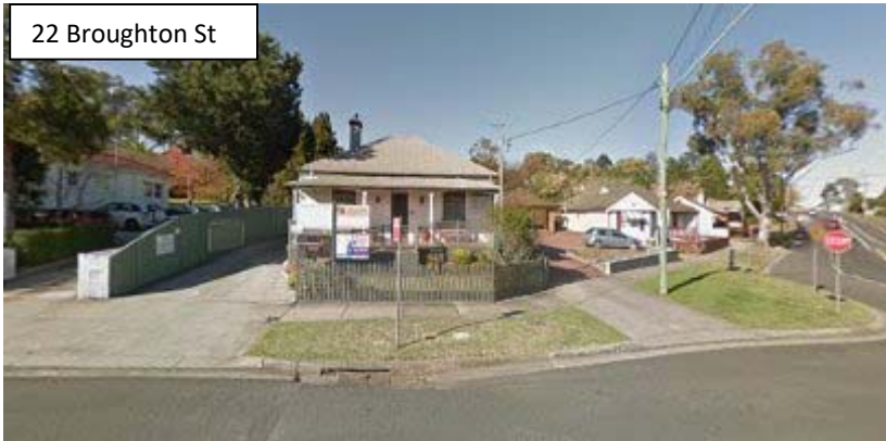
22 Broughton St

How 22 Broughton Street is to be safely accessed and exited is not clear from the roundabout design. How the retaining walls are to be designed and why they are needed are not explained in the documents provided. We trust these aspects of the proposal have been fully analysed and considered.