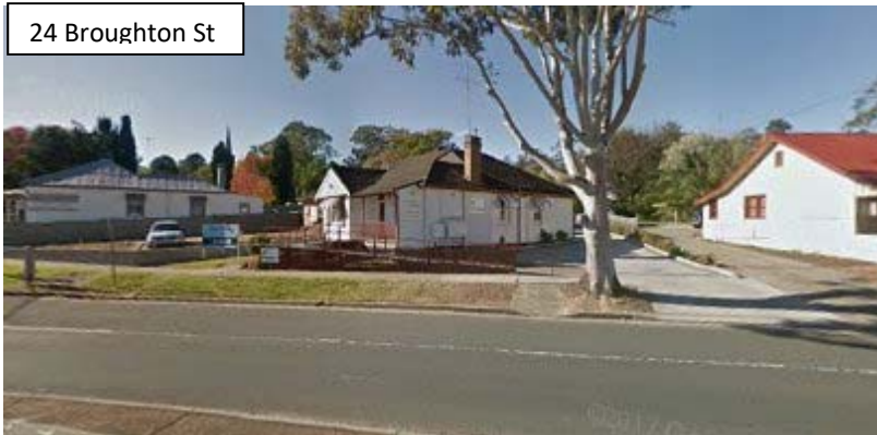
24 Broughton St

The design proposes a new driveway to service 24 Broughton Street. The detail of the potentially public and private nature of the driveway construction is not clear. The safety aspects of entering and existing directly from the roundabout were not clear and again we trust they have been fully considered.