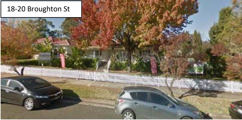
18-20 Broughton St

The possibility of blockages in the roundabout and driver frustration at times of higher traffic volume needs to be considered. However if the child care centre is approved traffic issues would likely be greater than with the roundabout.