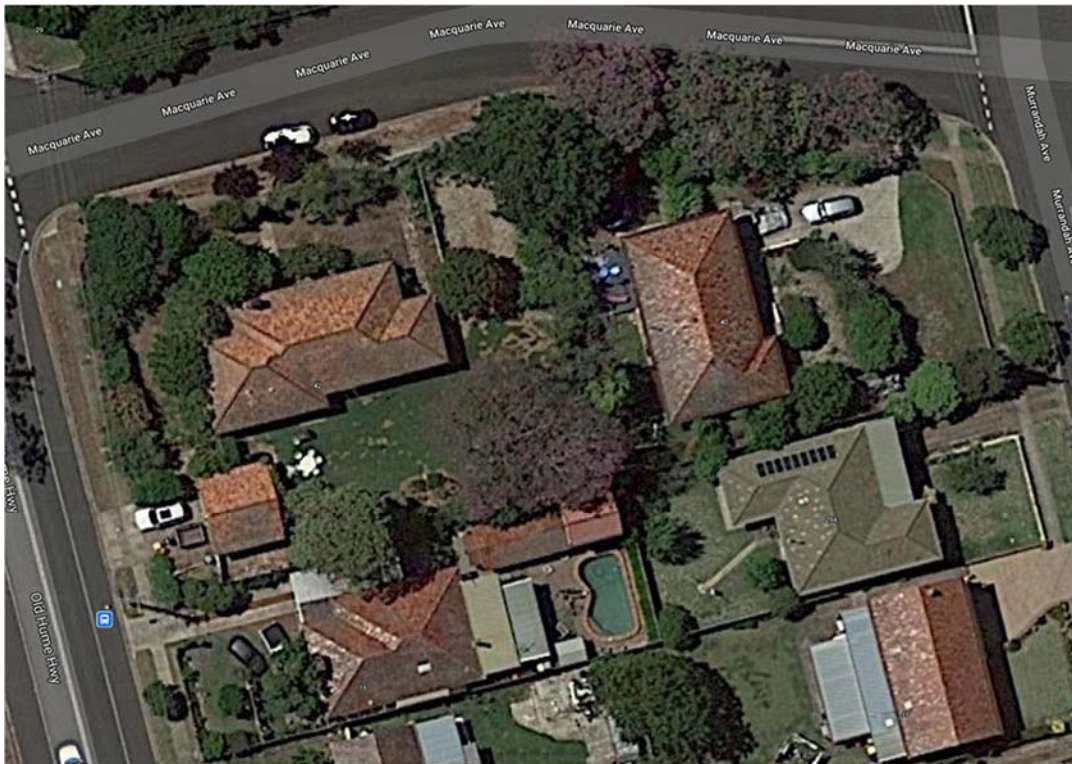
The existing tree canopy and open space.

This is a backward step in fostering the urban tree canopy and combating the effects of increasing urban heat (LSPS p. 21).