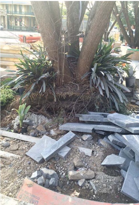
Careless regard for street trees could impact on their survival August 19, 2016 The District Reporter

CRAG met with Council staff on 11 August to discuss concerns raised in our submissions of 27 July 2016 and 4 August 2016 about the health of the street trees and flooding of the Whiteman's building and Argyle Street from the Bloom's carpark, which upgrades to the drainage system have not yet addressed. The Council staff was helpful and happy to provide information and agreed to provide written documentation within two or three weeks to dispel any community concerns.