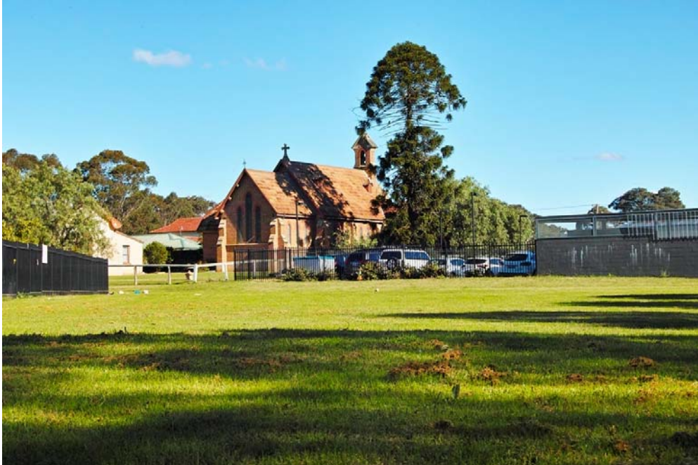
Photos taken from the corner of Camden Valley Way and Richardson Road. The Police station is to the right.

The proposal to amend the LEP zoning to allow more commercial development in this view corridor area is totally inappropriate. As stated in the CP the most important view of the St Thomas' Church is that from the intersection of Camden Valley Way and Richardson Road. This view allows the church to be seen in its semi-rural setting, as the church on the hill, the historical spiritual focus of the town. A car wash would clearly detract from the semi-rural setting and would do nothing towards interpretation of the early history of Narellan, a concept articulated throughout the principles of the Burra Charter.